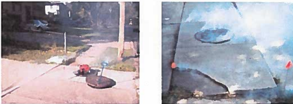
High-capacity blowers are used to pump smoke into a manhole (left photo). In the right photo, smoke is pushed into the system and emerges from cracks in the sidewalk and at a downstream manhole.